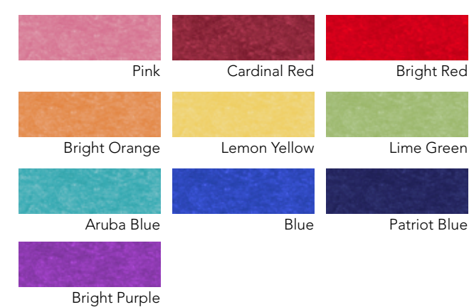
Premium Colors - Natural Finishes