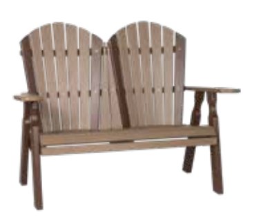
#503 - 4' Loveseat Weathered Wood/Tudor Brown