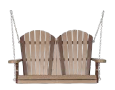
#505 - 4' Swing Weathered Wood/Tudor Brown