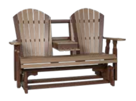
#508A - 5' Glider w/ Pullout Weathered Wood/Tudor Brown