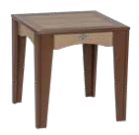
#422 - Square End Table Weathered Wood/Tudor Brown