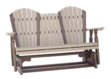
#508 - 5' Glider Weathered Wood/Tudor Brown