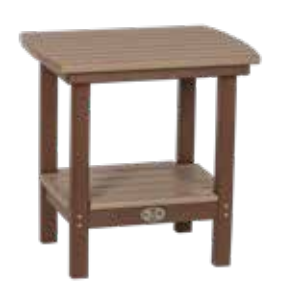
#402 - Deluxe End Table Weathered Wood/Tudor Brown