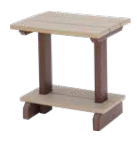
#400 - 17" x 20" End Table Weathered Wood/Tudor Brown