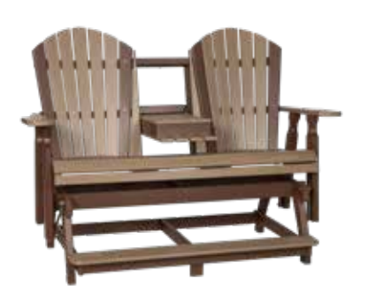
#508CH - 5' Glider w/ Pullout Weathered Wood/Tudor Brown