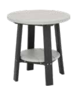
#417 - 21" Round End Table Dove Gray/Black