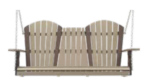
#511 - 5' Swing Weathered Wood/Tudor Brown